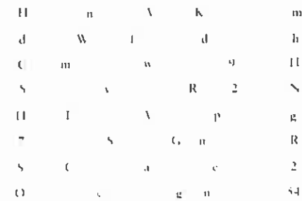
3. Larger Spacing