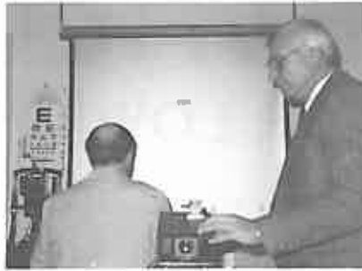
Figure 1. Tachistoscopic speed and span of recognition testing.

The patient should be placed at an intermediate distance (five to 10 feet) from the target. If the patient has difficulty seeing the form then the patient should be moved closer to the projection screen (see Figure 1).