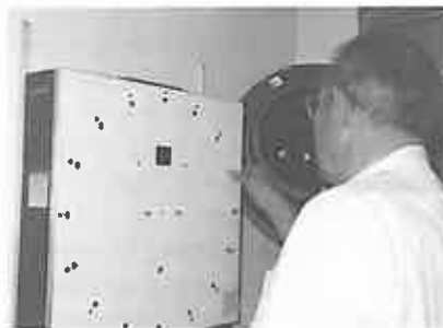
Figure 2. Saccadic testing employing a Wayne Saccadic Fixator

A localization target (i.e. the Wayne saccadic fixator and sequence rotator) a can be utilized to assess the stability of fixation and localization ability. A random presentation of lights set at a 60 second time interval is presented to the patient who is placed approximately 20 inches from the fixator board. This test is performed binocularly and the average number of correct responses during three successive trials is recorded (see Figure 2).