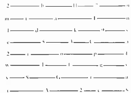
2. With Guide