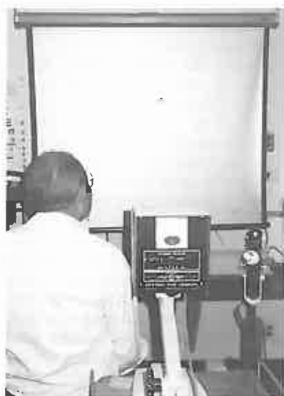
Figure 4. Dynamic visual acuity using a Keystone Kirshner Rotator.

A dynamic visual acuity test can be performed utilizing the Kirshner Rotator b or a Keystone Rotator c with an angled mirror. The patient sits approximately five feet from the screen and letters equivalent to the patient's distance acuity are rotated on the screen in a circular pattern which is approximately five feet in diameter. The rotator is initially set at 40 RPM. If the patient cannot read the rotating letter, the speed of rotation is reduced until the patient is capable of recognizing the letter or one can increase the letter size until the patient is able to correctly identify the letter (see Figure 4).