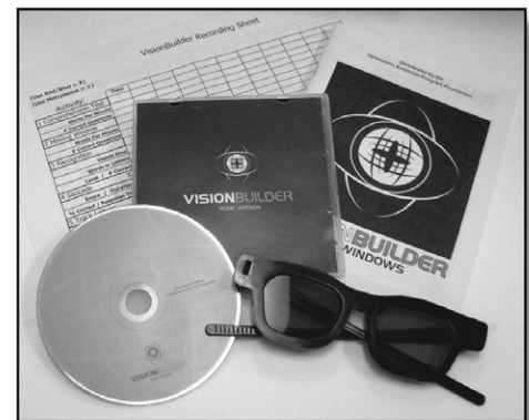
Note: Vision Builder is a Windows based program and will not run on a MAC Computer

Phone 800.424.8070 • Online at www.oepf.org OEP Foundation, Inc, 1921 E Carnegie Ave, Suite 3L, Santa Ana, CA 92705