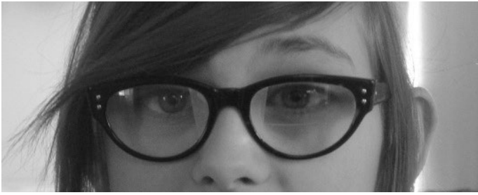
Figure 1: Typical application of binasal occlusion in my office.

approaches are inappropriate. It is important to adjust aspects such as width, angle, and wearing schedule size and location on a case-by-case basis, especially since this is completely non-invasive and easily modified. Nothing works all the time, but I have rarely had any negative feedback using the occlusion in this manner. I have in fact had a considerable number of immediately happier people.