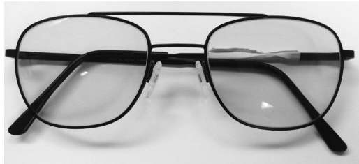
Figure 2: Blue tint with 20% optical density