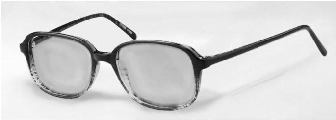
Figure 1: FL-41 tint with 55% optical density.