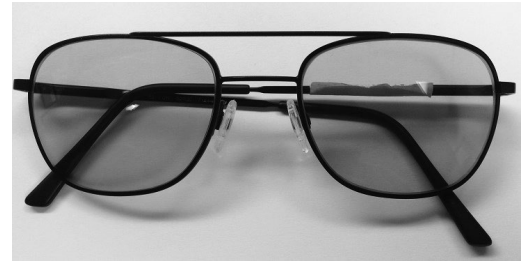
Figure 3: Gray tint with 40% optical density (base) that transitions to 80% optical density.

suggests a broadly distributed, multisensory and nociceptive response for photophobia.